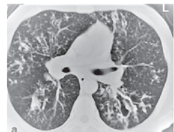
FIGURE 2. Computed tomography scan.